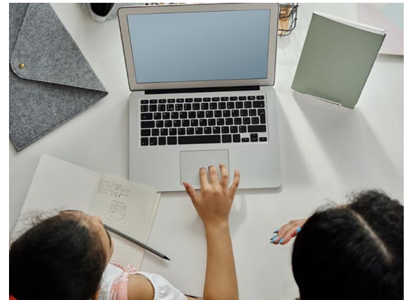
5000 UK Kids to receive free Digital Glove and Digital Skills Camp from OpenUK

“Digital inclusion is critical for all young people in the UK. I am extremely proud we can support this at OpenUK, as we teach kids appropriate skills for a future in technology. Supporting the UK’s leadership in open source software will help create the next generation of technologists and business people and build their understanding of relevant