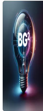
BG2Pod with Br... BG2Pod