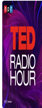
TED Radio Hour NPR