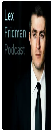
Lex Fridman Po... Lex Fridman